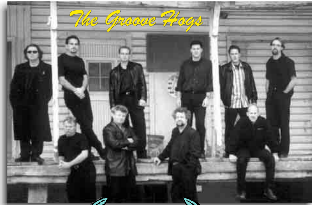
The Groove Hogs