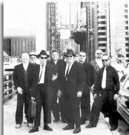
THE BLUZ BROTHERS